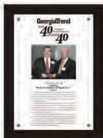
40 Under 40 Picture Plaque #2 $250.00

10-1/2" x 13" black gloss plaque with honoree's name and specialty in black on the silver-plated surface. Designed to hang on your office wall. $200.00