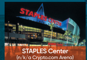
STAPLES Center (n/k/a Crypto.com Arena)