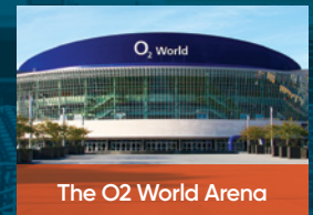
The O2 World Arena