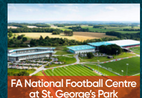
FA National Football Centre at St. George's Park