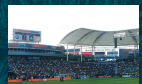
The StubHub Center