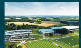
FA National Football Centre at St. George's Park