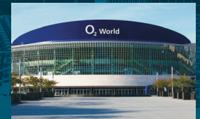
The O2 World Arena