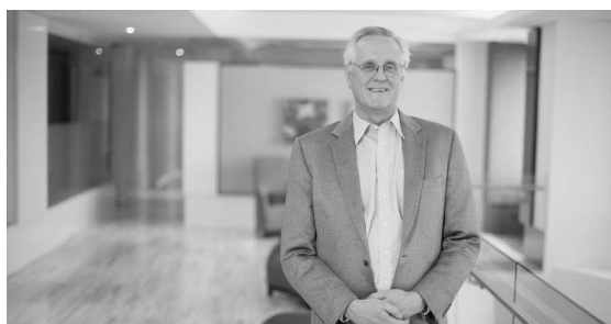
J. Bennett Clark